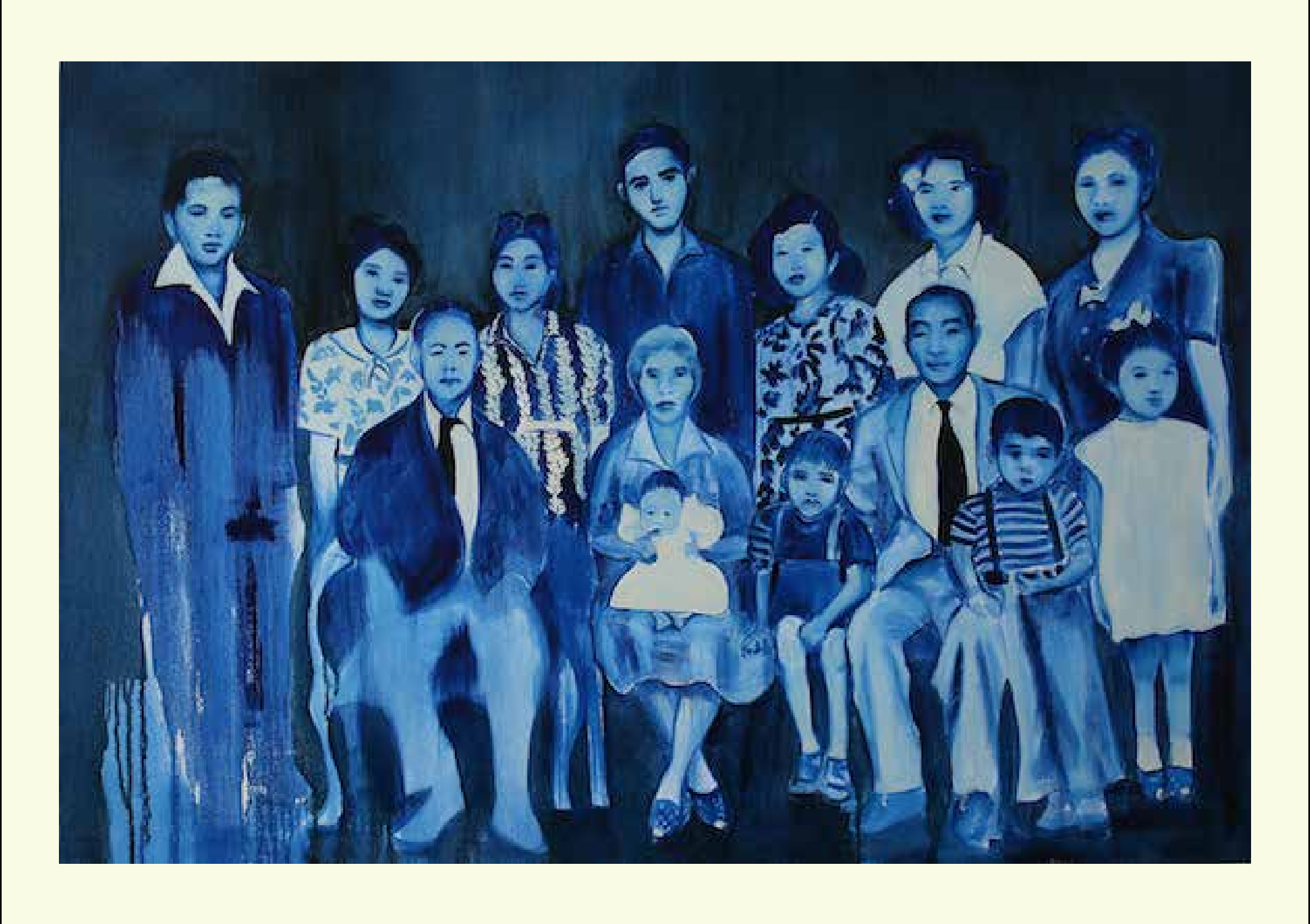
FAMILY PORTRAIT 3, 30 X 45 IN., OIL ON CANVAS, 2013