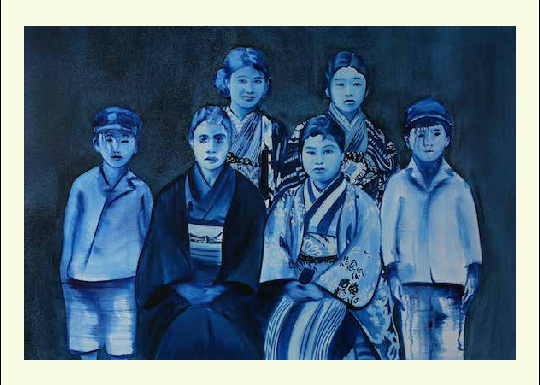
FAMILY PORTRAIT 1, 30 X 45 IN., OIL ON CANVAS, 2013