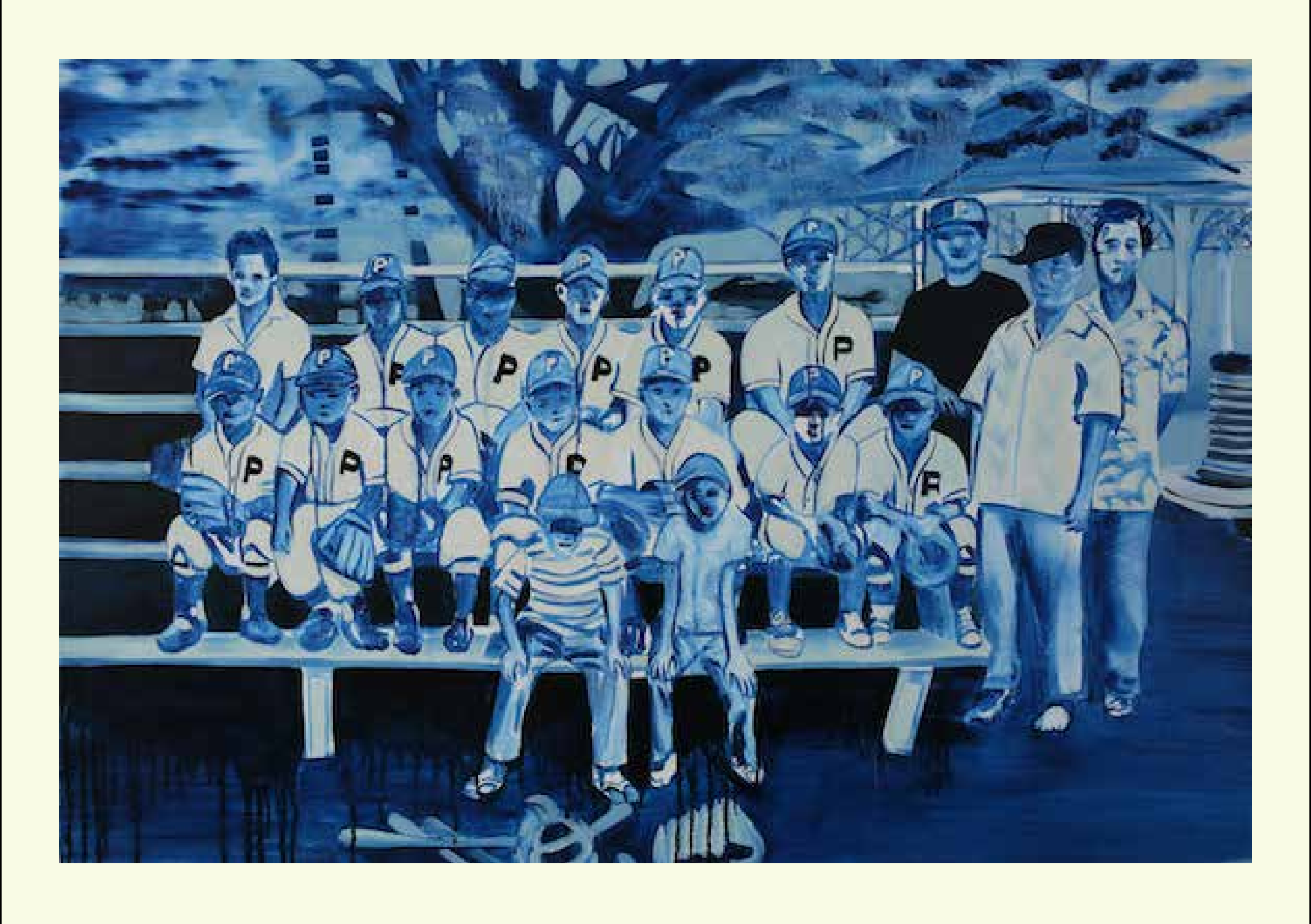
BASEBALL TEAM, 30 X 45 IN., OIL ON CANVAS, 2013