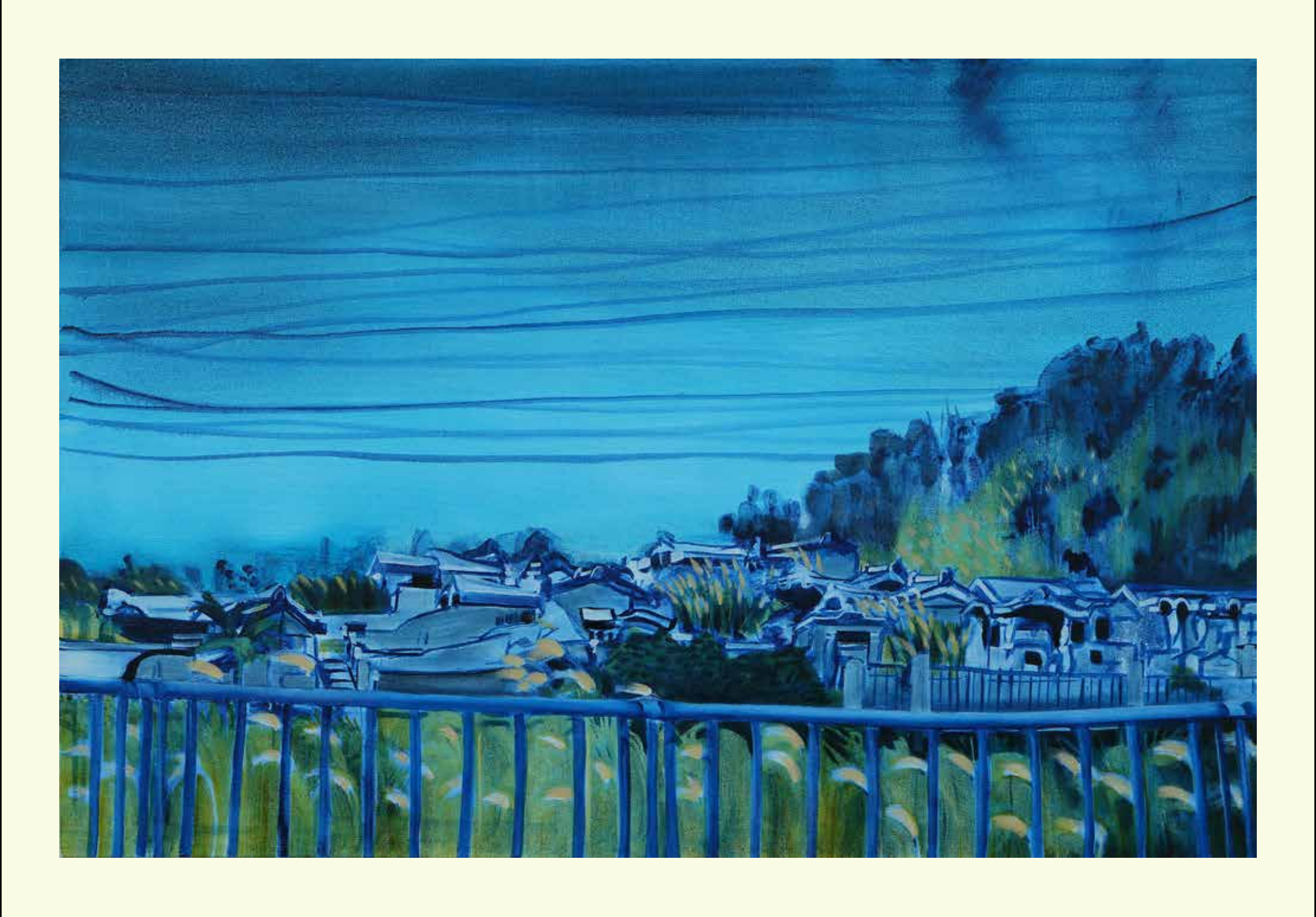
GRAVES BY THE SEA, 30 X 45 IN., OIL ON CANVAS, 2013