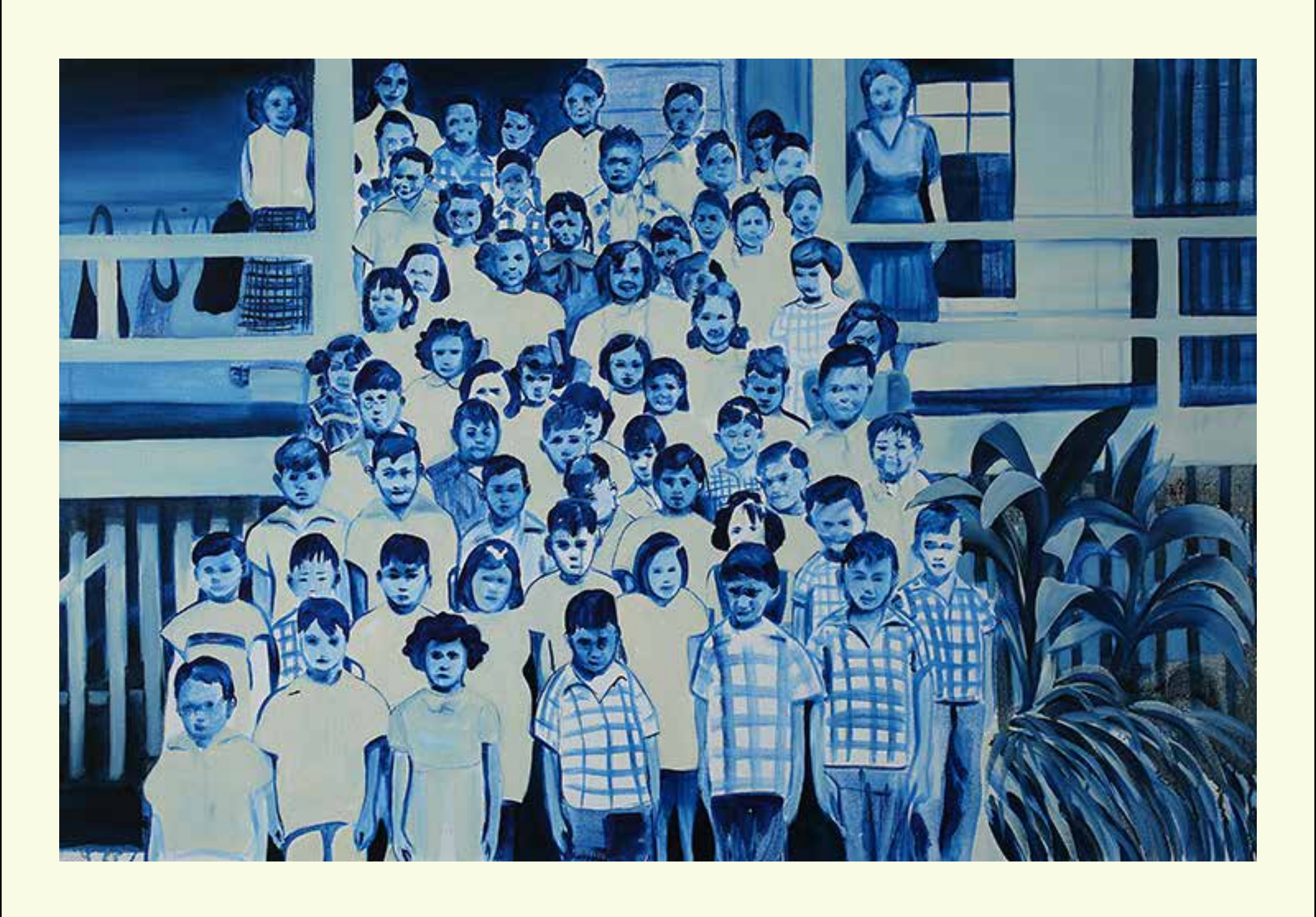
ELEMENTARY SCHOOL, 30 X 45 IN., OIL ON CANVAS, 2013