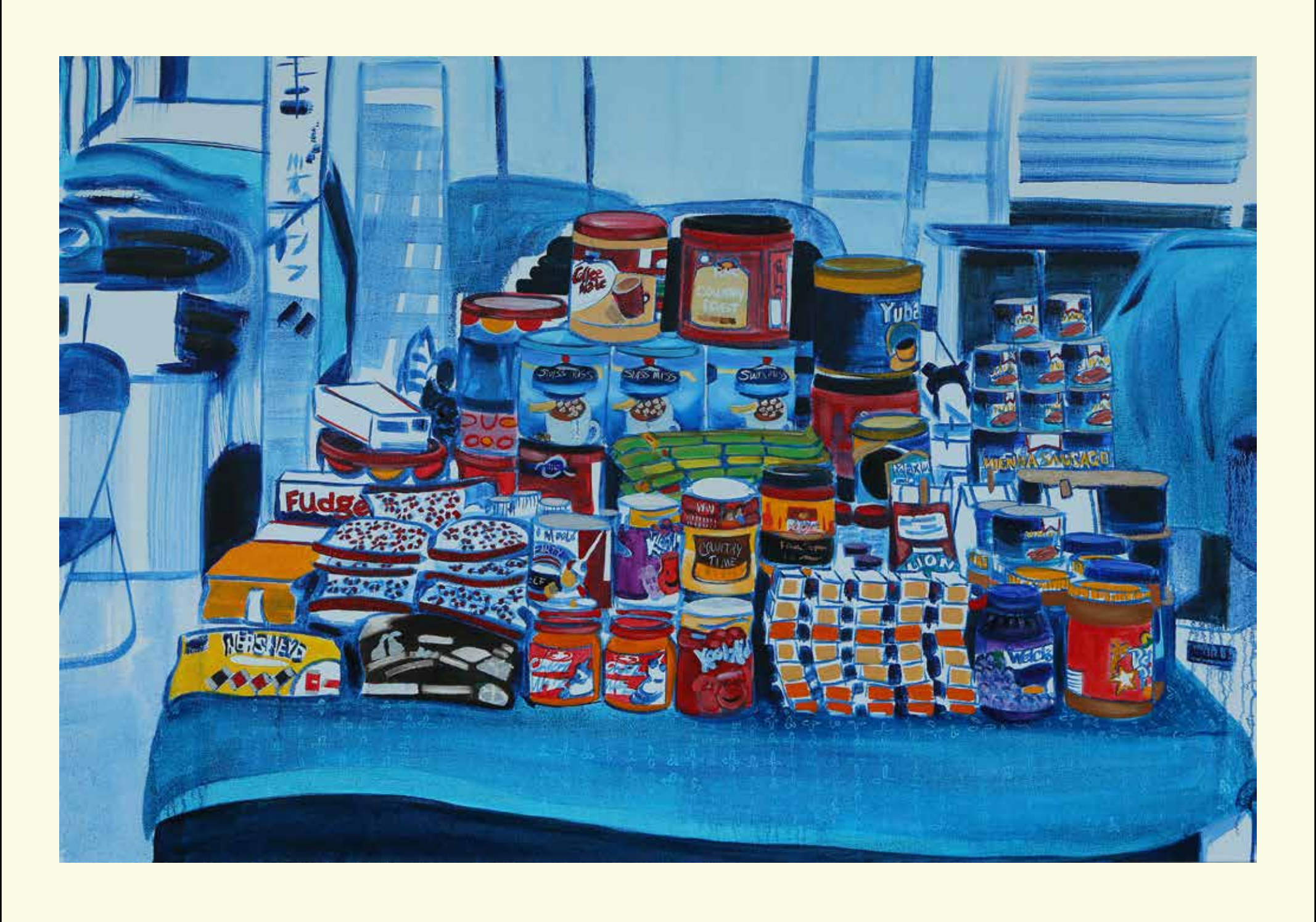
BLACK MARKET, 30 X 45 IN., OIL ON CANVAS, 2013