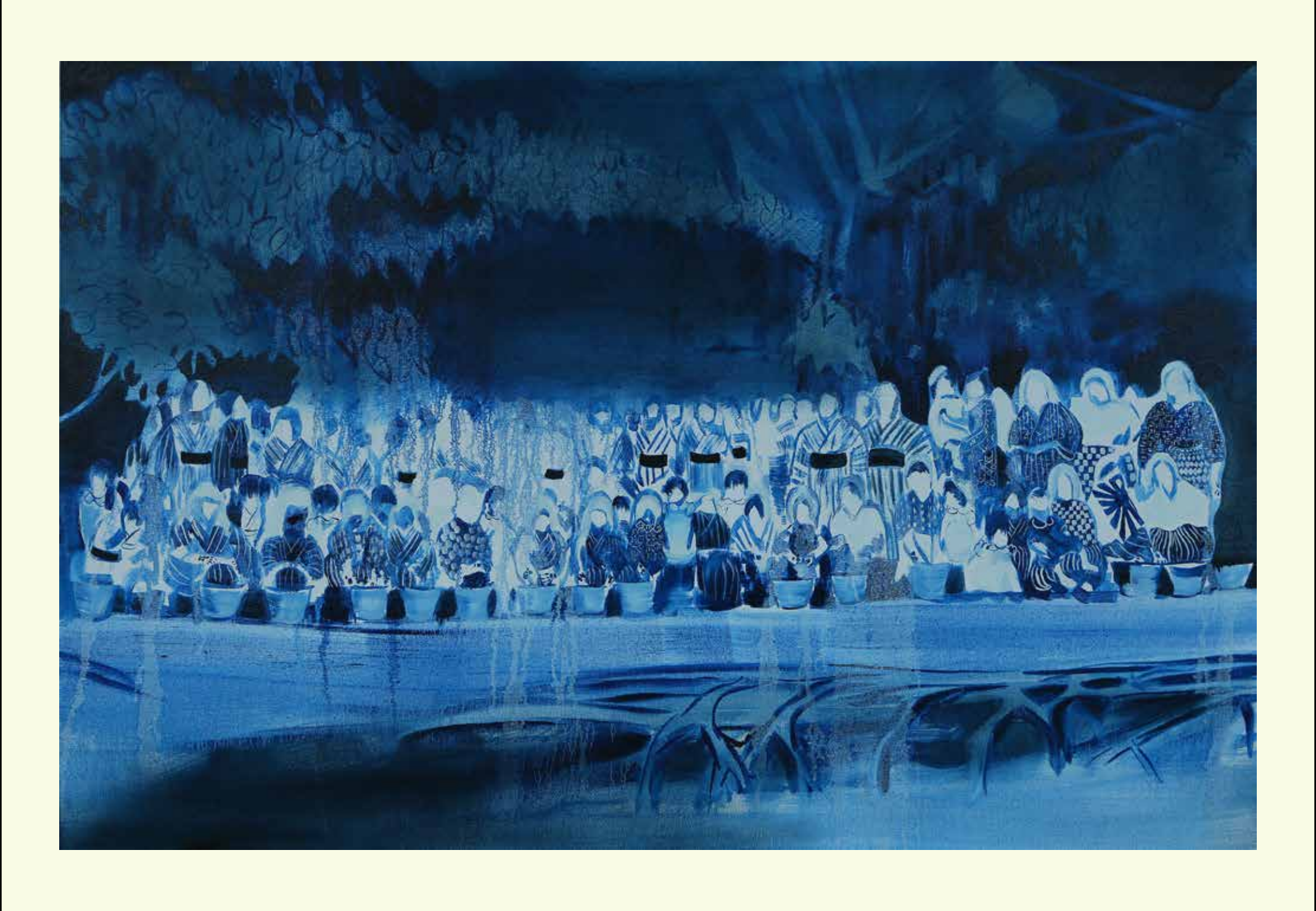
FIRE DRILL, 30 X 45 IN., OIL ON CANVAS, 2013