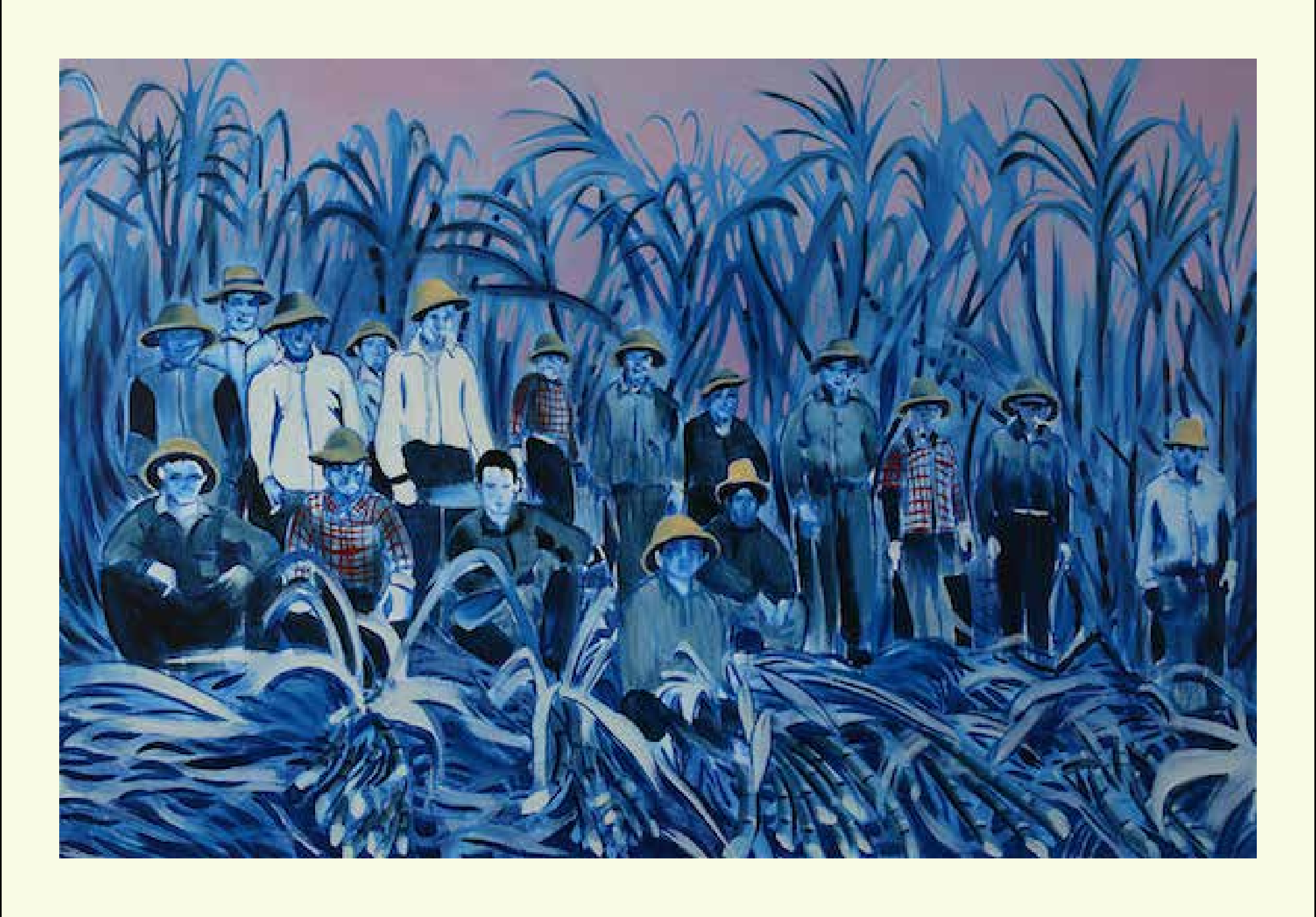
CANEFIELD WORKERS, 30 X 45 IN., OIL ON CANVAS, 2013