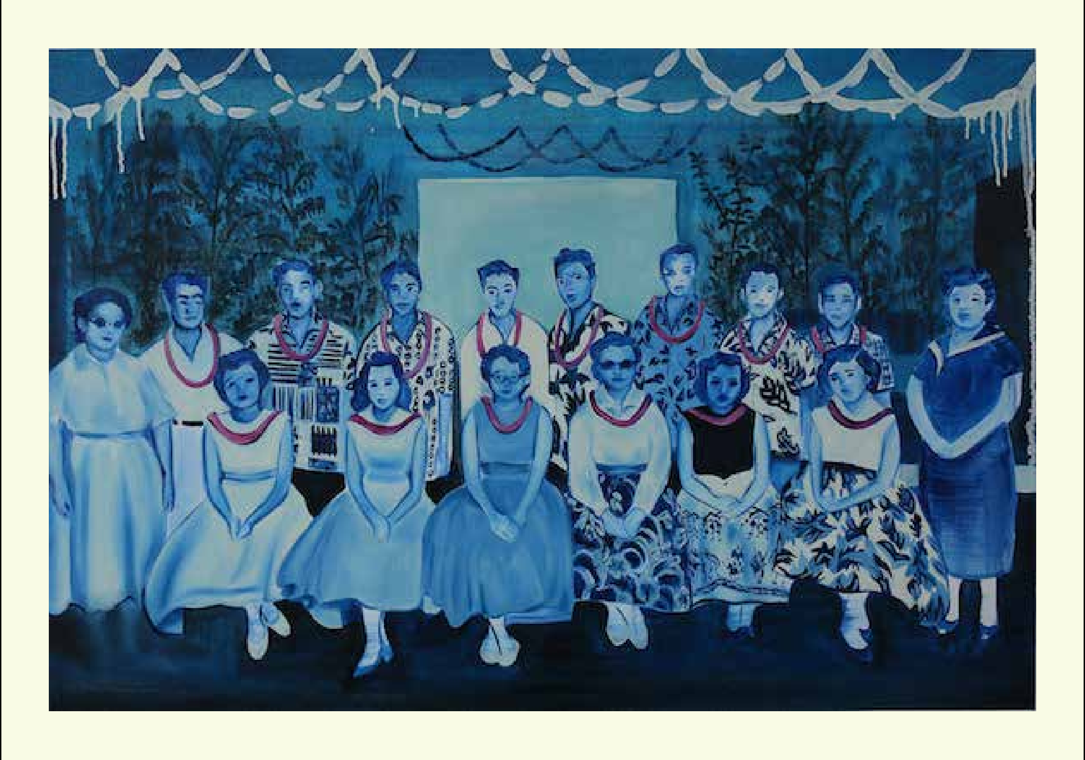
JAPANESE LANGUAGE SCHOOL, 30 X 45 IN., OIL ON CANVAS, 2013