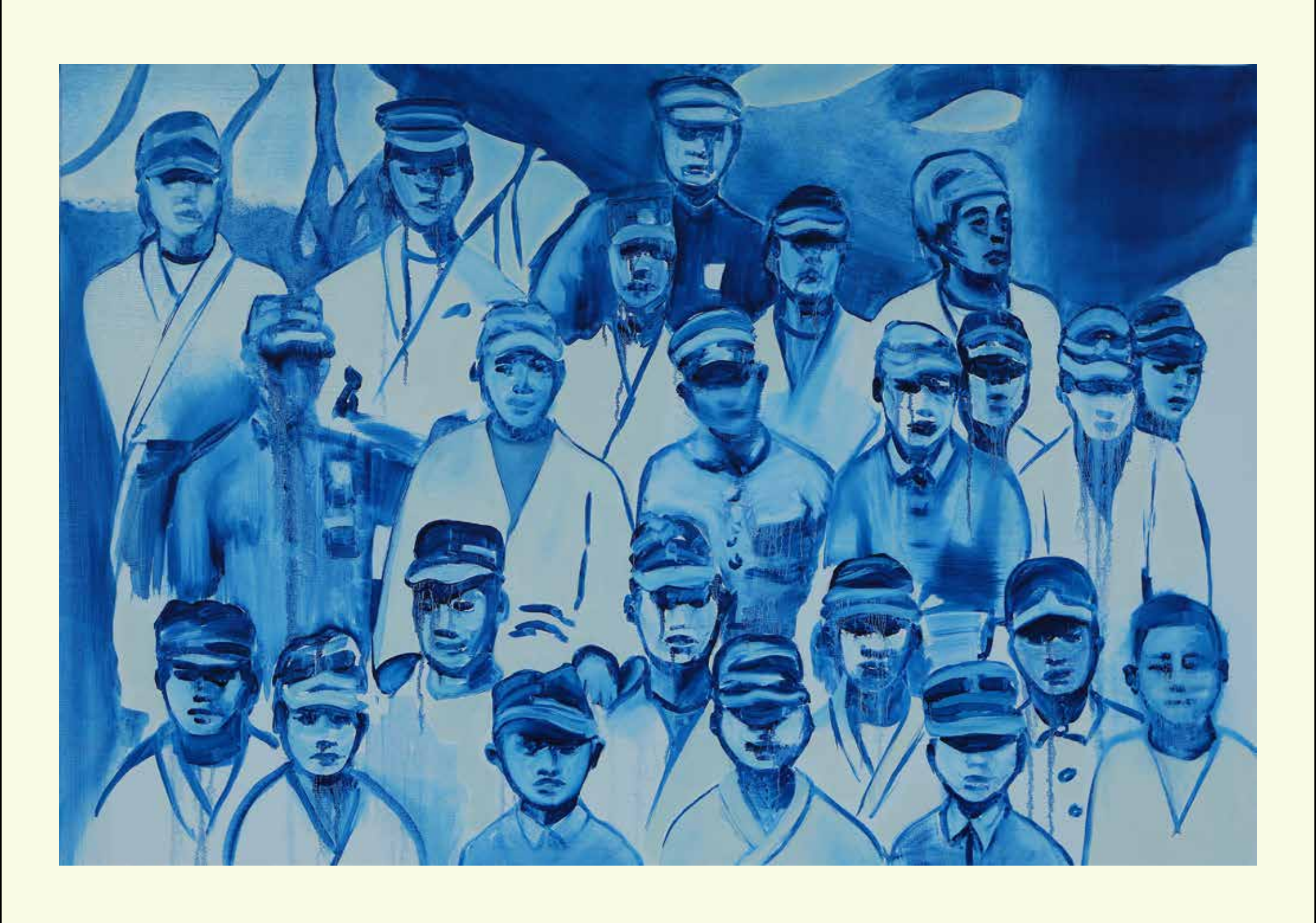
SOLDIER BOYS, 30 X 45 IN., OIL ON CANVAS, 2013