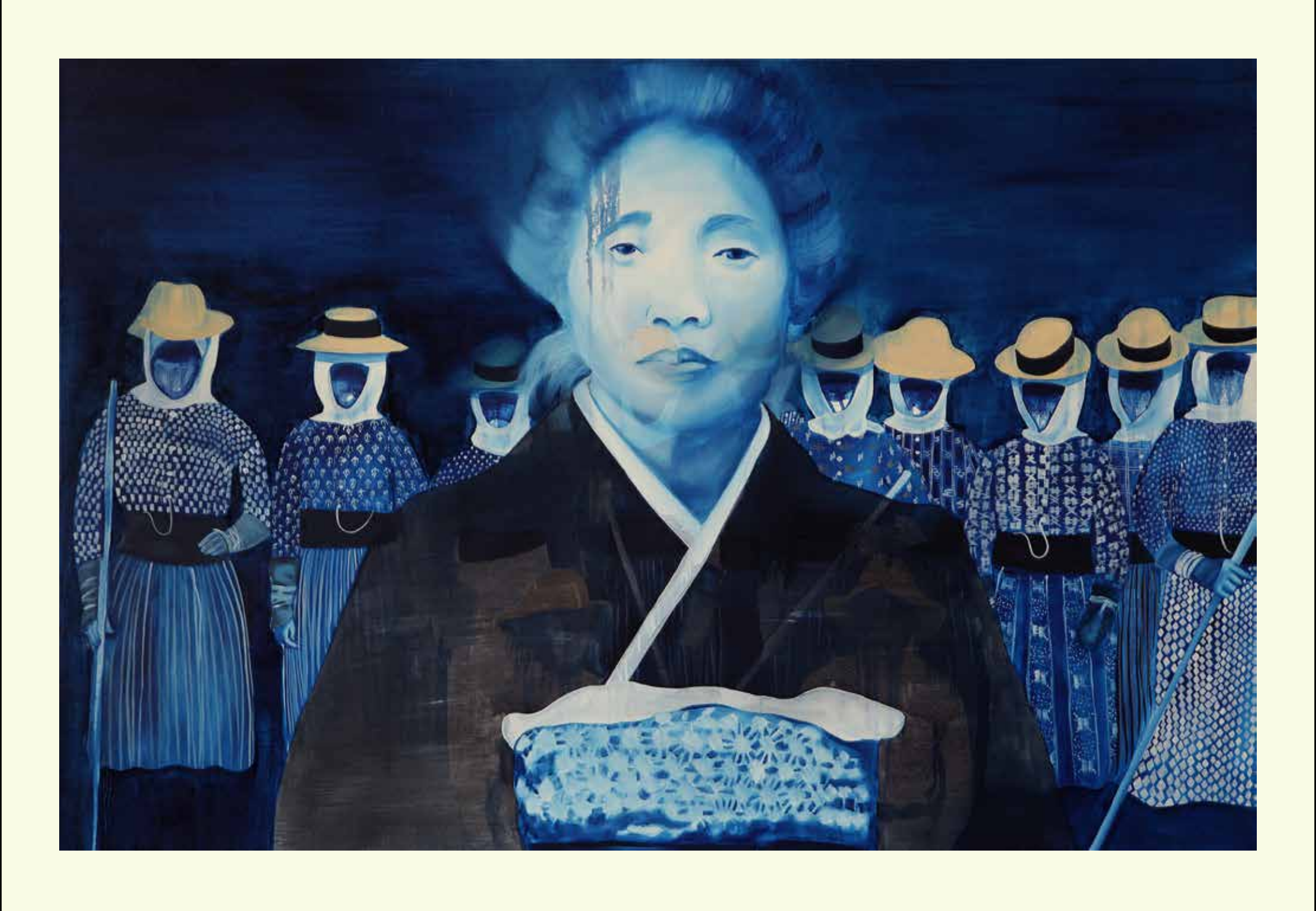
ISSEI, 30 X 45 IN., OIL ON CANVAS, 2011