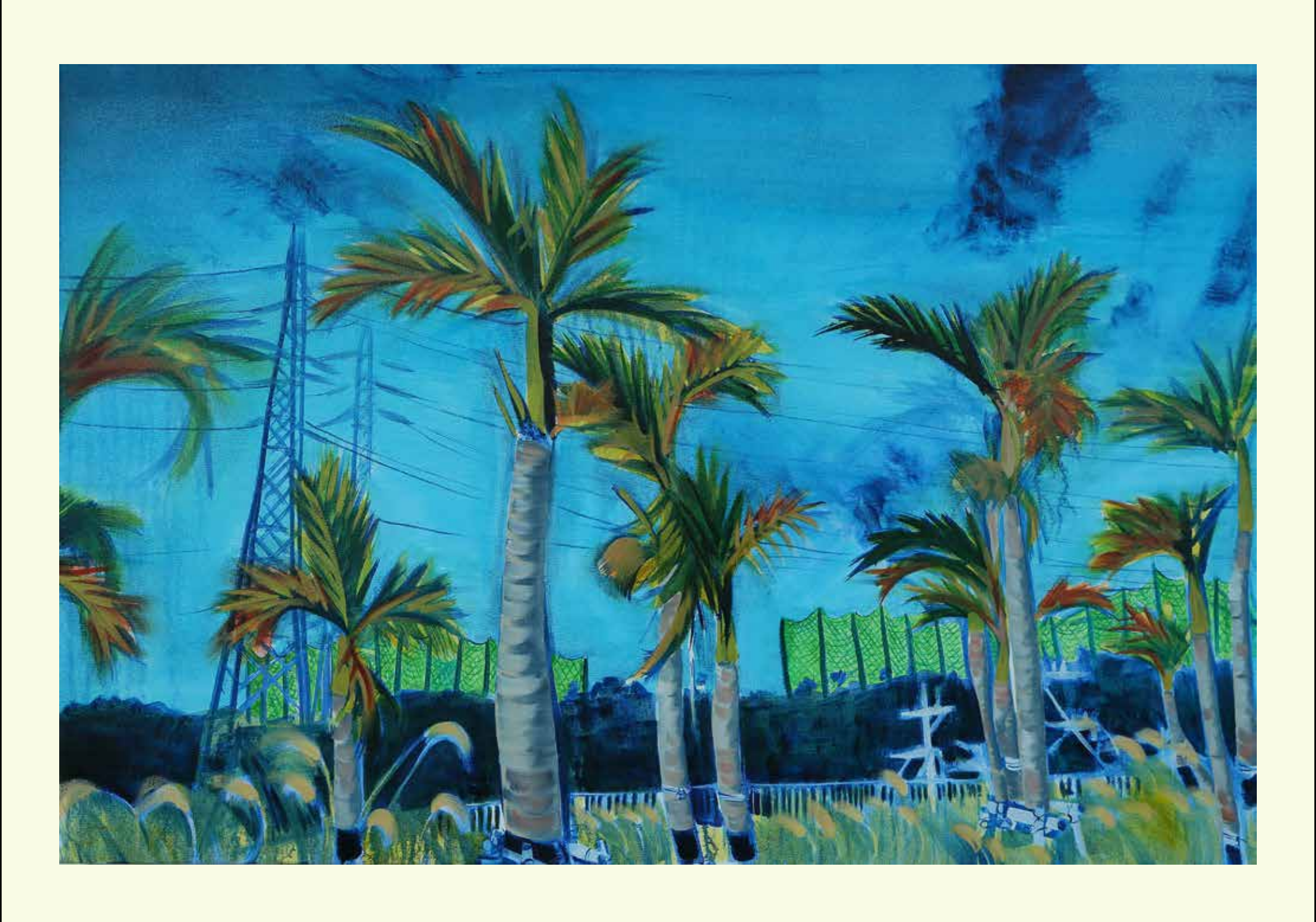
POWER LINES, 30 X 45 IN., OIL ON CANVAS, 2013