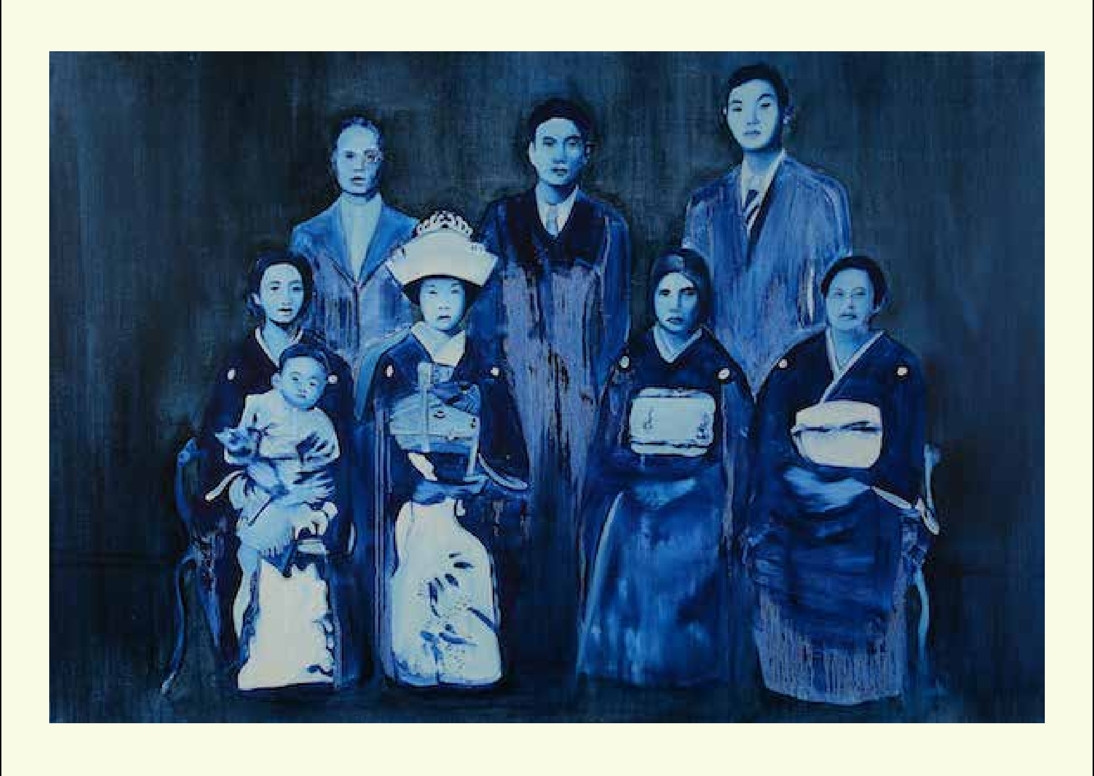
FAMILY PORTRAIT 2, 30 X 45 IN., OIL ON CANVAS, 2013