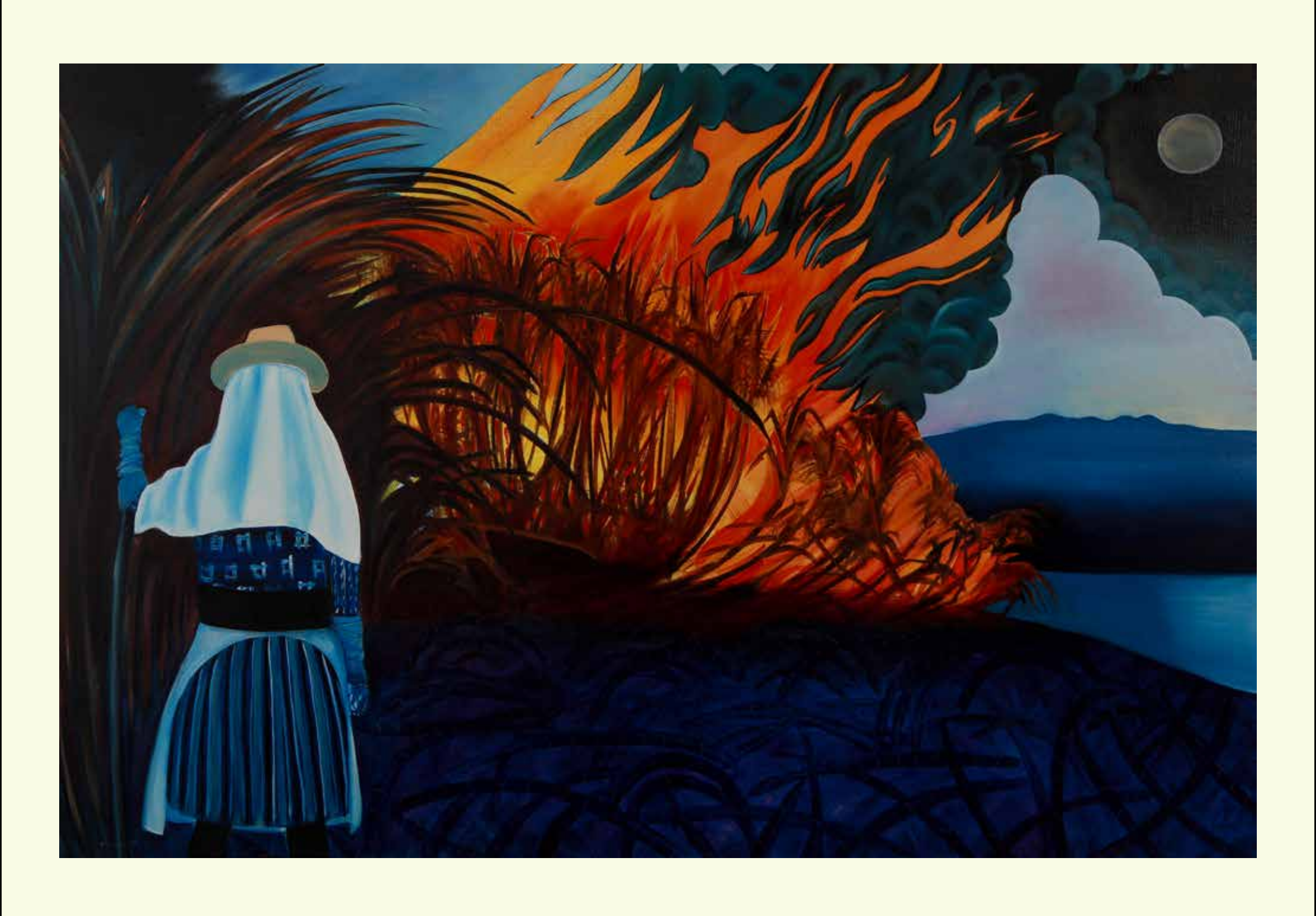
CANE FIRE, 30 X 45 IN., OIL ON CANVAS, 2010