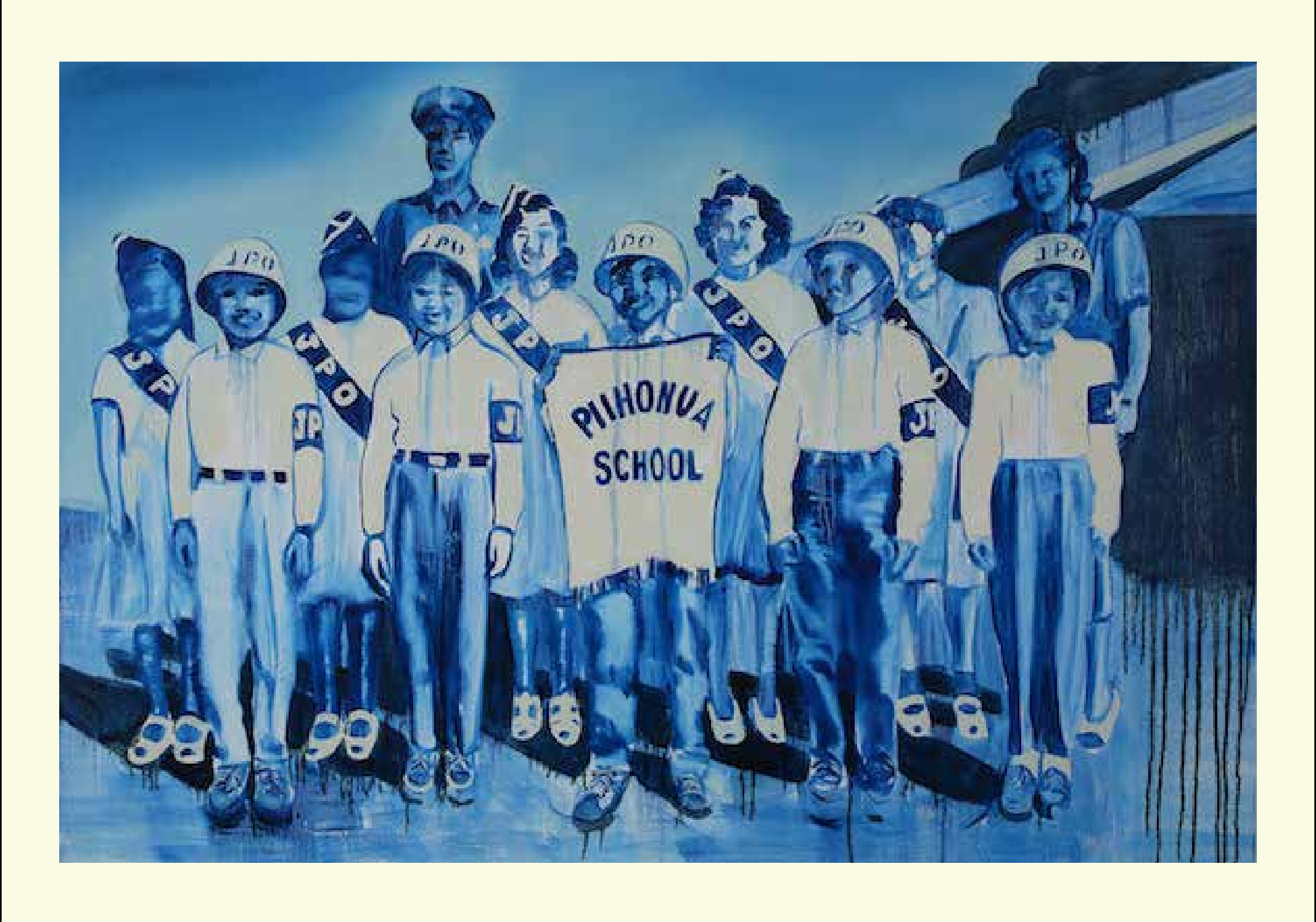
JUNIOR POLICE ORGANIZATION, 30 X 45 IN., OIL ON CANVAS, 2013