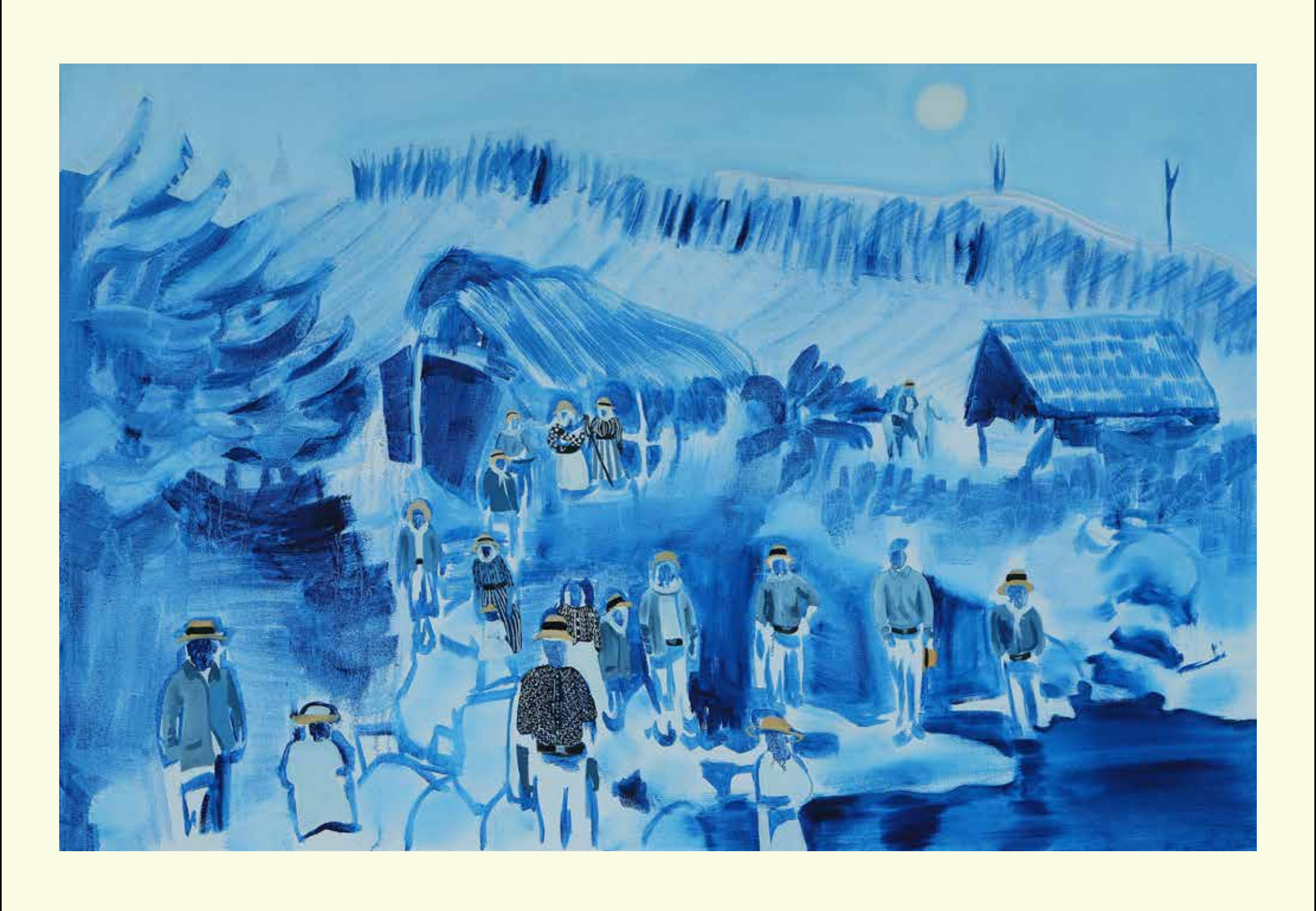
PI'IHONUA, 30 X 45 IN., OIL ON CANVAS, 2013