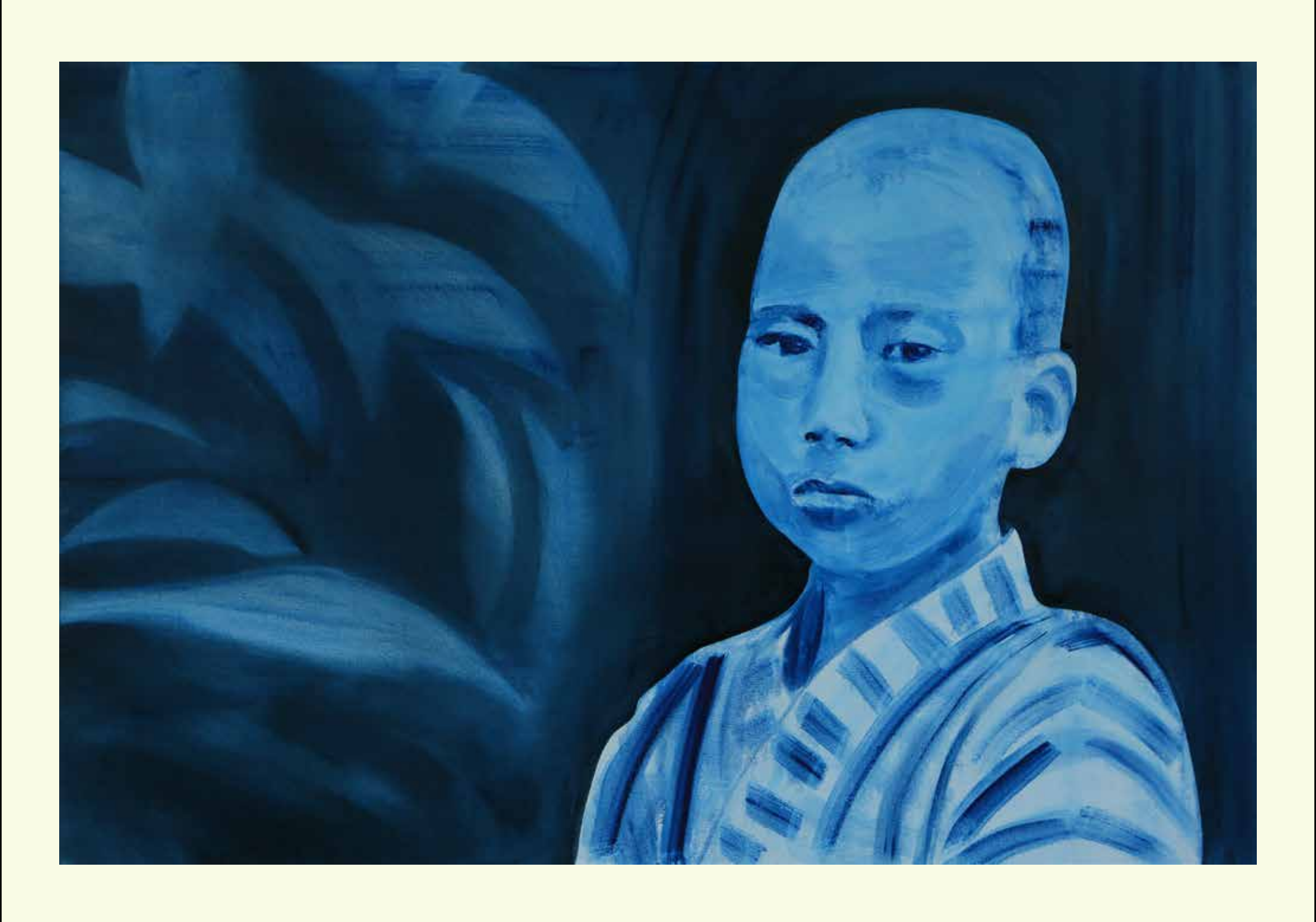
BEFORE THE WAR, 30 X 45 IN., OIL ON CANVAS, 2013