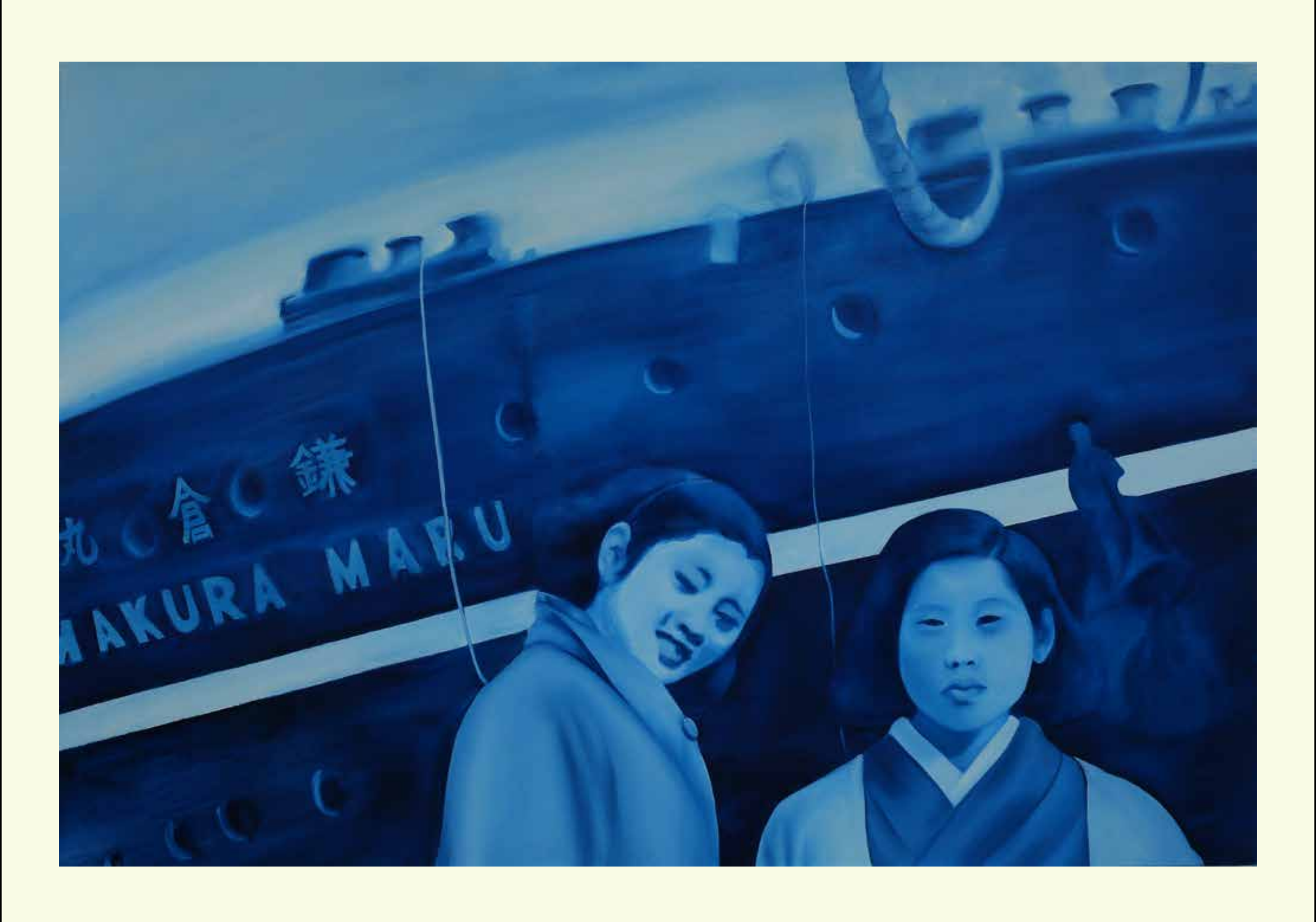
KIBEI NISEI, 30 X 45 IN., OIL ON CANVAS, 2012