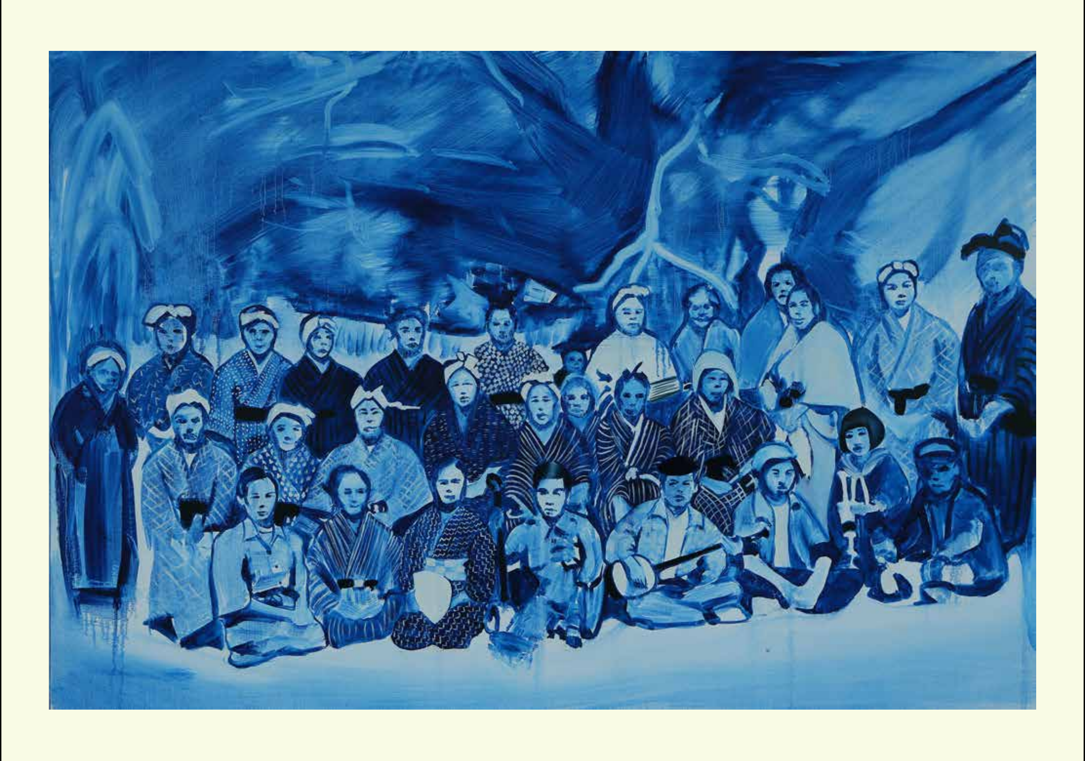
UNTITLED (OKINAWA) 30 X 45 IN., OIL ON CANVAS, 2013