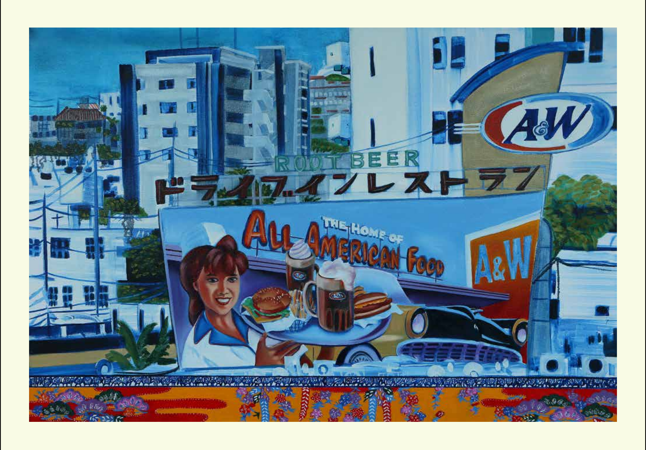
OKINAWA - ALL AMERICAN FOOD, 30 X 45 IN., OIL ON CANVAS, 2013