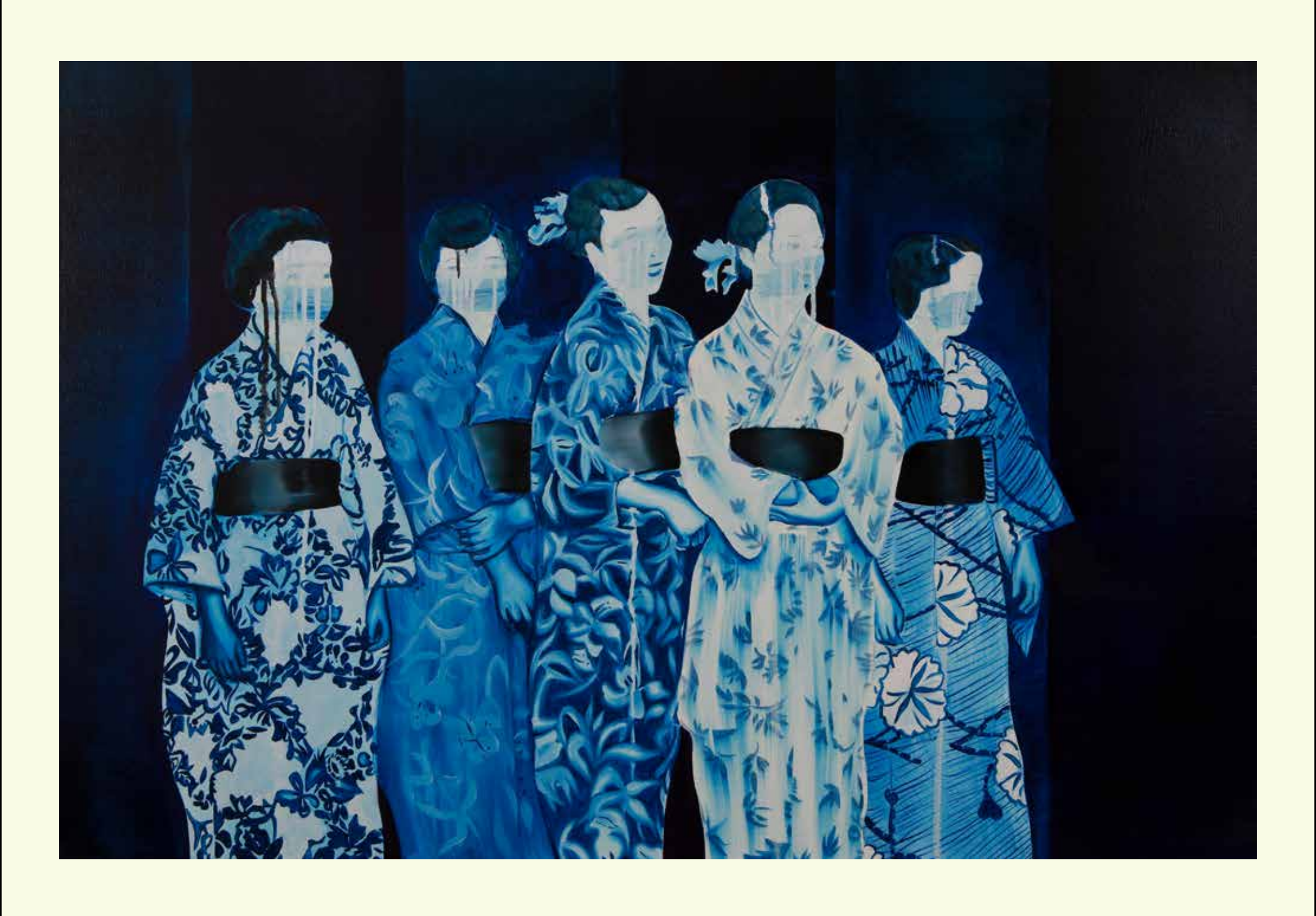
OBON , 30 X 45 IN., OIL ON CANVAS, 2010