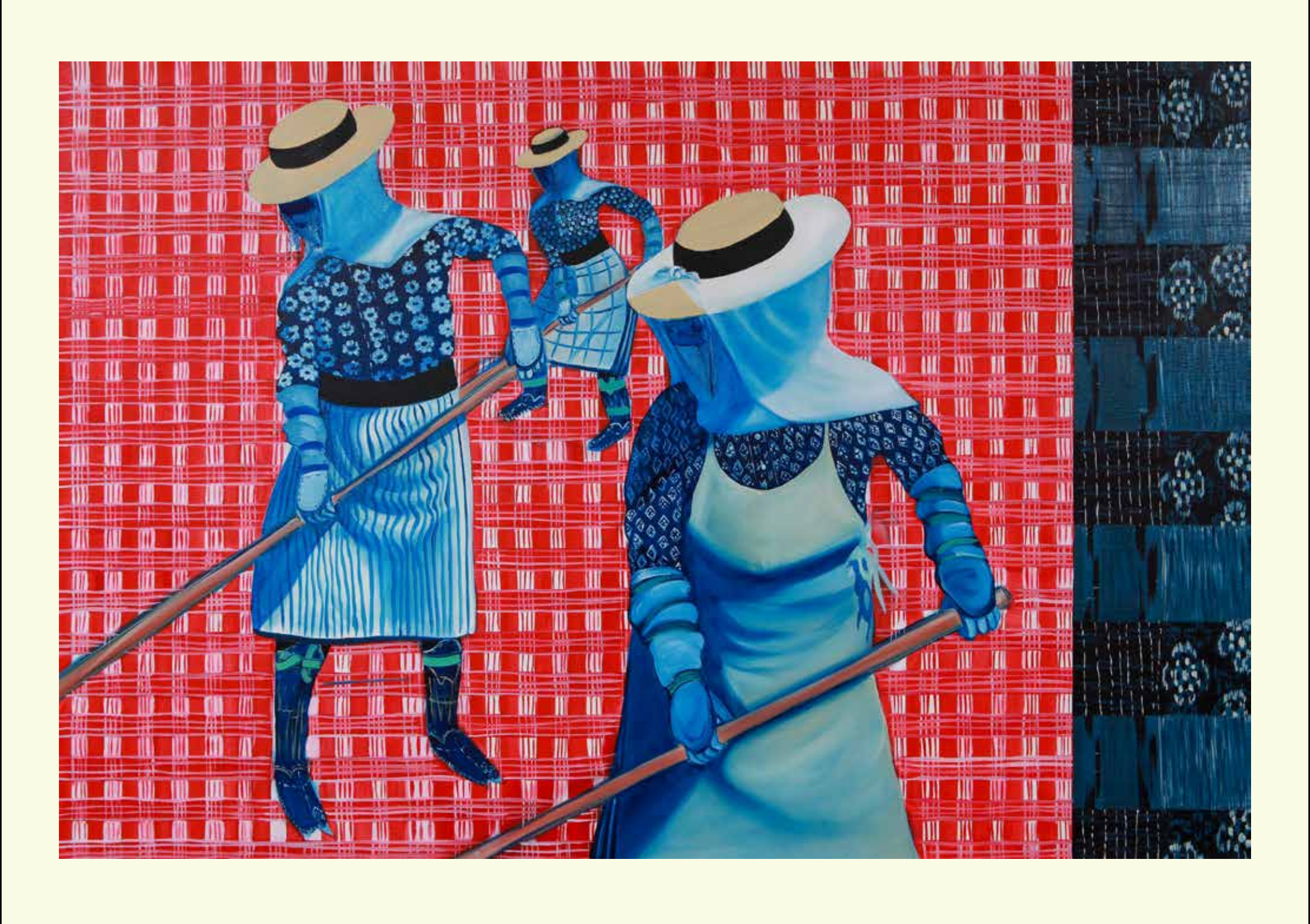
PALAKA, 30 X 45 IN., OIL ON CANVAS, 2010